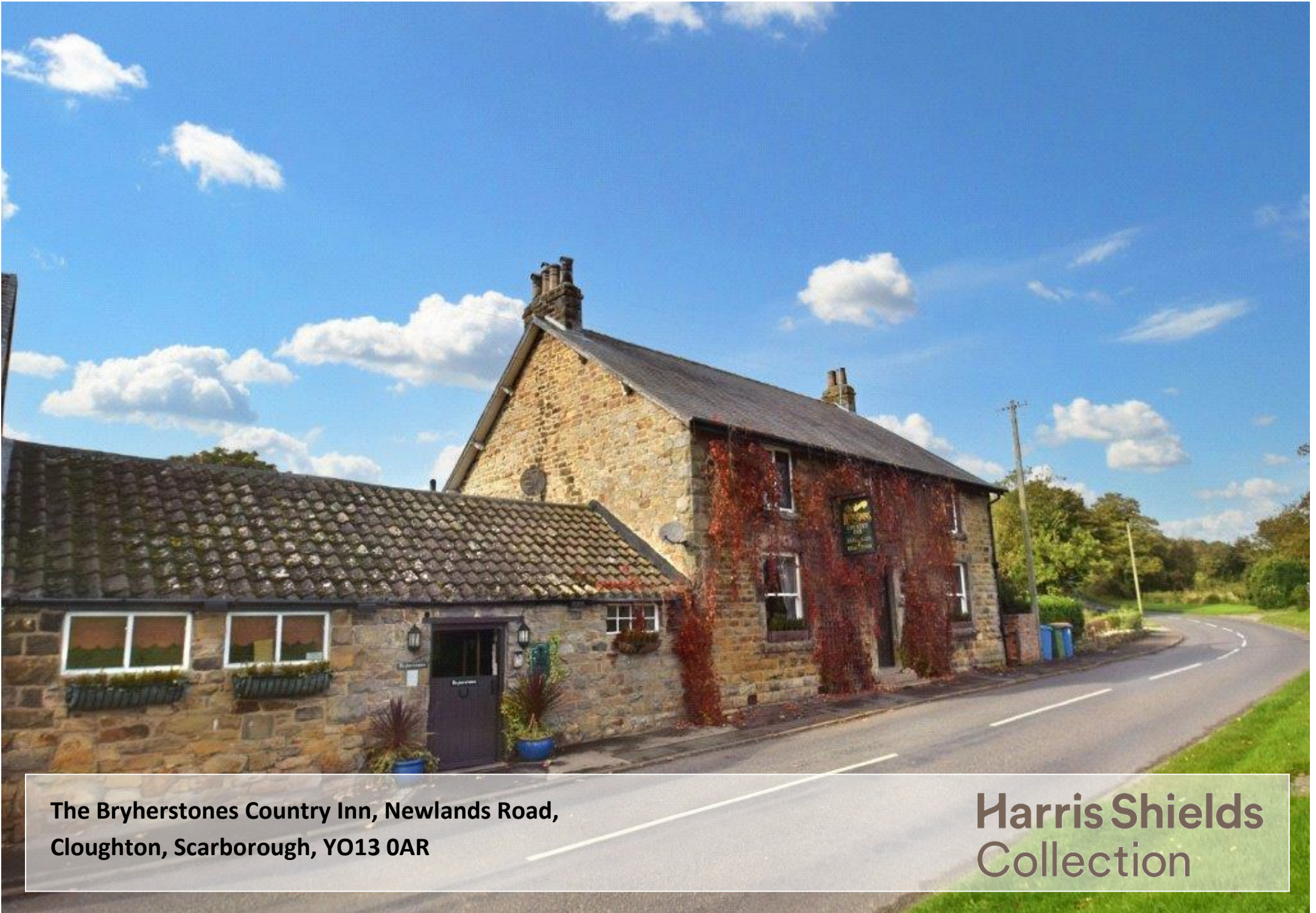
The Bryherstones Country Inn, Newlands Road, Cloughton, Scarborough, YO13 0AR